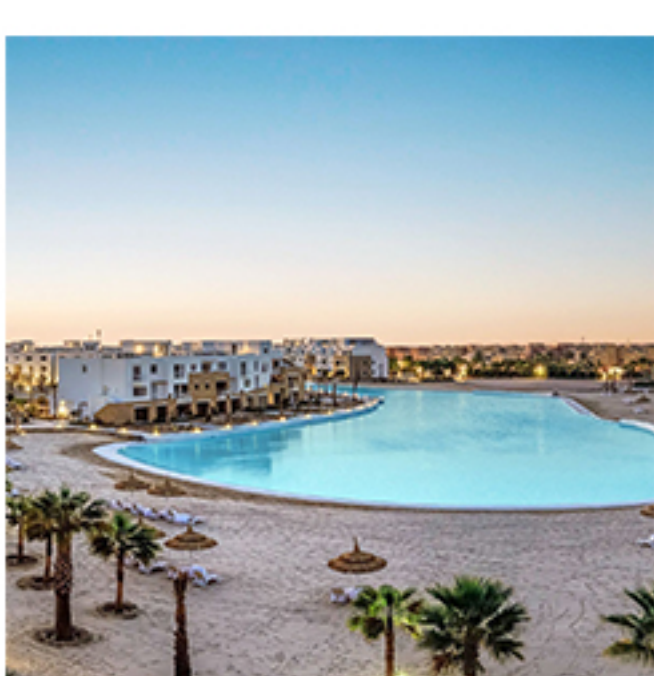
Lago Mar | Texas City, USA